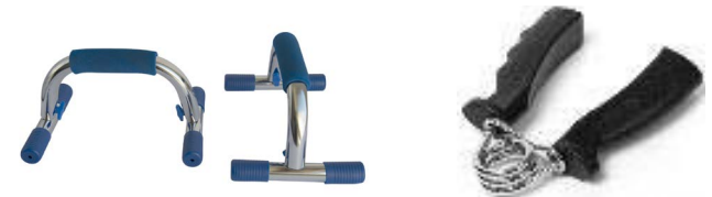
Pushups handles and handgrips